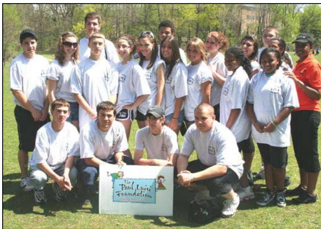
Tuckahoe High School students and representatives of the Paul Luisi Foundation felt proud of their efforts to bring smiles to children of The Morgan Stanley Children's Hospital.

Tuckahoe High School students and The Paul Luisi Foundation recently donated a Nintendo Wii Fun Station (rolling cart with flat screen TV & Nintendo Game System) to the pediatric oncology ward of The Morgan Stanley Children's Hospital. The students raised this money during their Walk for a Cure 2009.