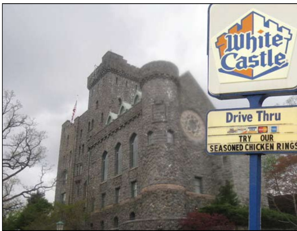
Adaptive re-use may take a medieval structure like The Castle on the Hudson in Tarrytown (above) and transform it into a castle of a very different kind, a White Castle.